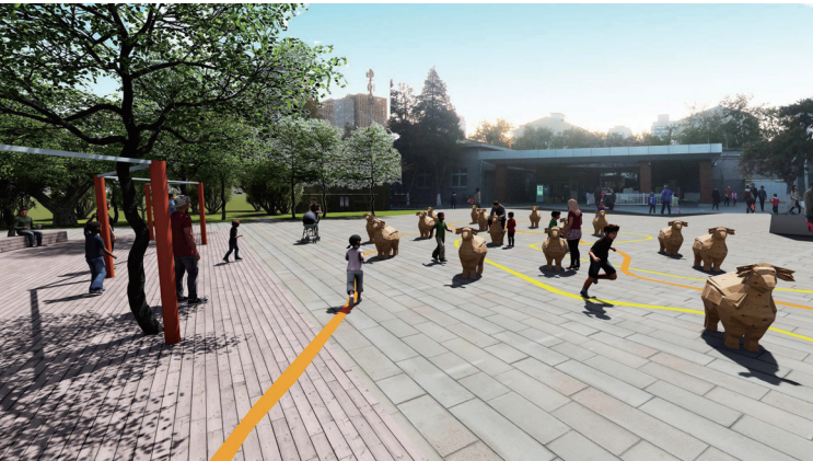
图 1